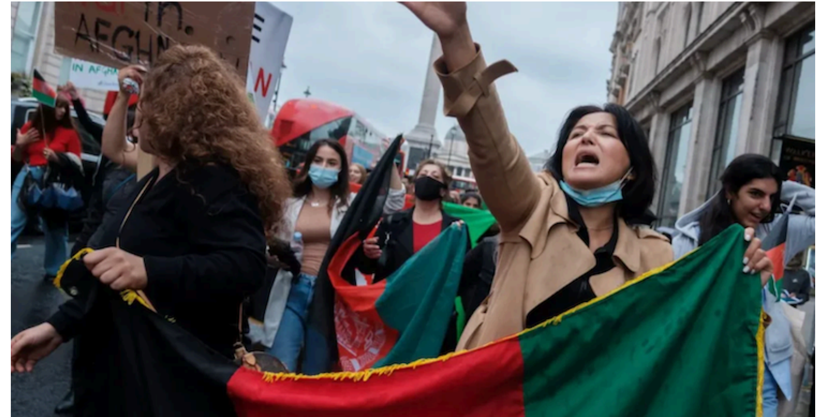
Women in England protest the violence of the Taliban takeover of Afghanistan in August 2021

Now in its third decade of existence, the Taliban began as an armed group that emerged in the 1990s out of Afghanistan's Civil War. By 1996, they had come to rule most of the country.